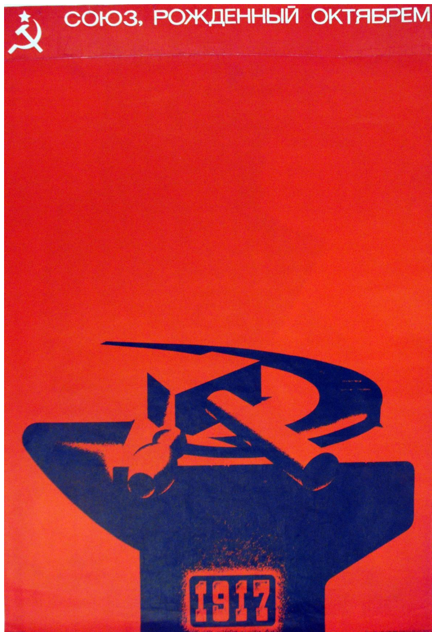
Union, Born of October, 1917